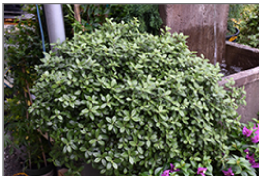
Golf Ball Kohuhu