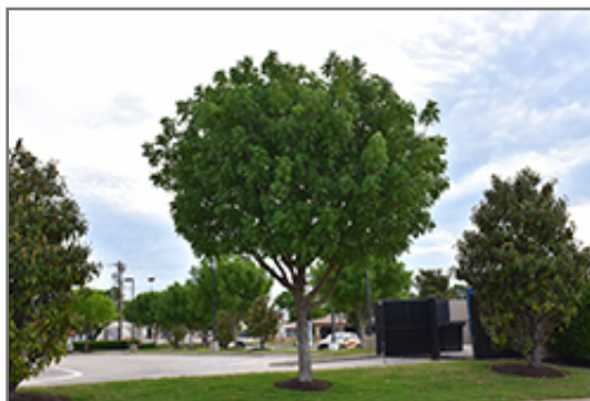
Chinese Pistache