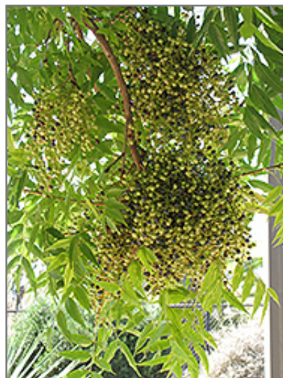
Chinese Pistache fruit

This tree should only be grown in full sunlight. It is very adaptable to both dry and moist growing conditions, but will not tolerate any standing water. It is not particular as to soil type or pH. It is highly tolerant of urban pollution and will even thrive in inner city environments. This species is not originally from North America.