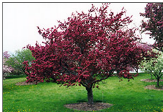
Profusion Flowering Crab in bloom