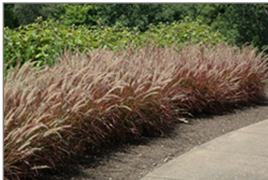
Purple Fountain Grass in bloom

Purple Fountain Grass will grow to be about 4 feet tall at maturity, with a spread of 3 feet. It grows at a medium rate, and under ideal conditions can be expected to live for approximately 10 years. As an herbaceous perennial, this plant will usually die back to the crown each winter, and will regrow from the base each spring. Be careful not to disturb the crown in late winter when it may not be readily seen!