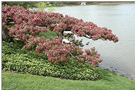
Candied Apple Flowering Crab in bloom

Candied Apple Flowering Crab is recommended for the following landscape applications;