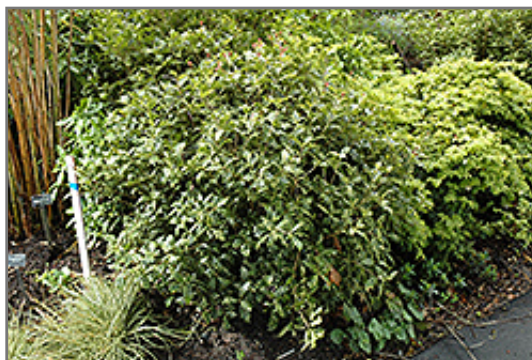
Variegated False Holly