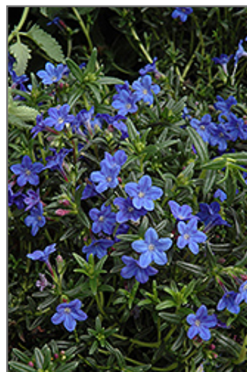
Grace Ward Lithodora flowers