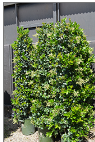
Texanum Japanese Privet (topiary form)