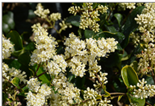
Texanum Japanese Privet flowers

Texanum Japanese Privet is recommended for the following landscape applications;