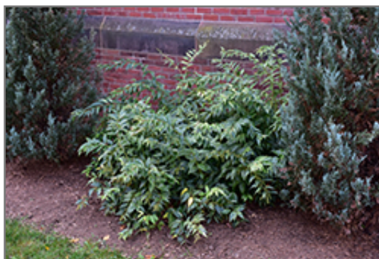
Rainbow Fetterbush