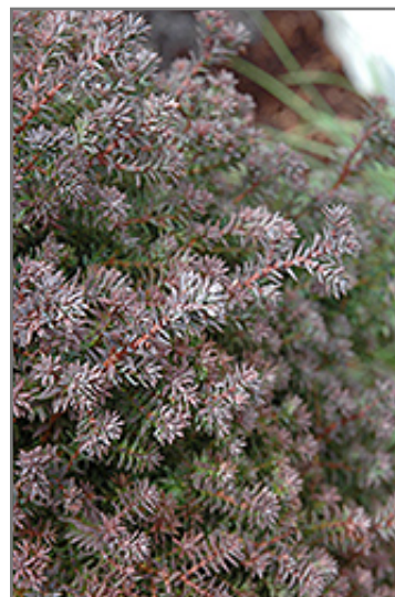
Red Star Whitecedar foliage