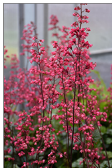
Paris Coral Bells flowers