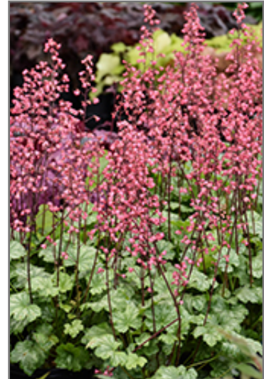
Paris Coral Bells flowers

Paris Coral Bells is recommended for the following landscape applications;