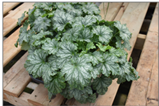
Paris Coral Bells foliage