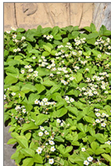
Common Wild Strawberry in bloom

Common Wild Strawberry features dainty white cup-shaped flowers with yellow eyes along the stems from late spring to early summer. Its attractive tomentose round compound leaves remain green in colour throughout the season. It features an abundance of magnificent cherry red berries from late spring to late summer.