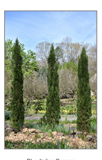
Blue Italian Cypress