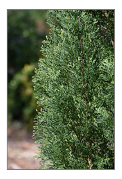
Blue Italian Cypress foliage