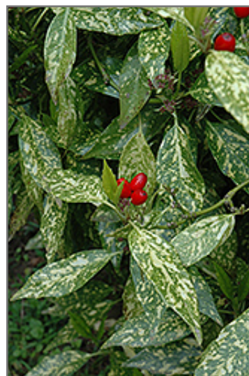
Variegated Japanese Aucuba fruit