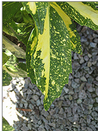
Variegated Japanese Aucuba foliage

This shrub does best in partial shade to shade. It does best in average to evenly moist conditions, but will not tolerate standing water. It is not particular as to soil pH, but grows best in rich soils. It is somewhat tolerant of urban pollution, and will benefit from being planted in a relatively sheltered location. Consider applying a thick mulch around the root zone in winter to protect it in exposed locations or colder microclimates. This is a selected variety of a species not originally from North America.