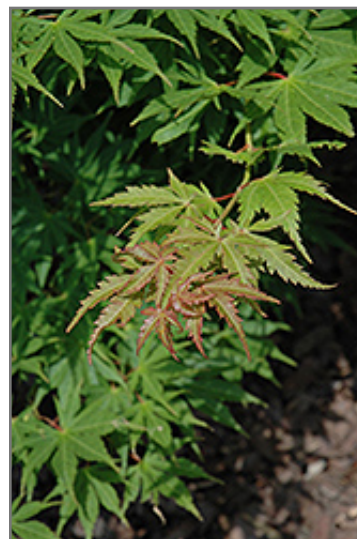
Yellow Bird Japanese Maple foliage