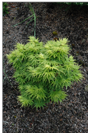
Mikawa Yatsubusa Japanese Maple

Mikawa Yatsubusa Japanese Maple is a fine choice for the yard, but it is also a good selection for planting in outdoor pots and containers. With its upright habit of growth, it is best suited for use as a 'thriller' in the 'spiller-thriller-filler' container combination; plant it near the center of the pot, surrounded by smaller plants and those that spill over the edges. It is even sizeable enough that it can be grown alone in a suitable container. Note that when grown in a container, it may not perform exactly as indicated on the tag - this is to be expected. Also note that when growing plants in outdoor containers and baskets, they may require more frequent waterings than they would in the yard or garden.