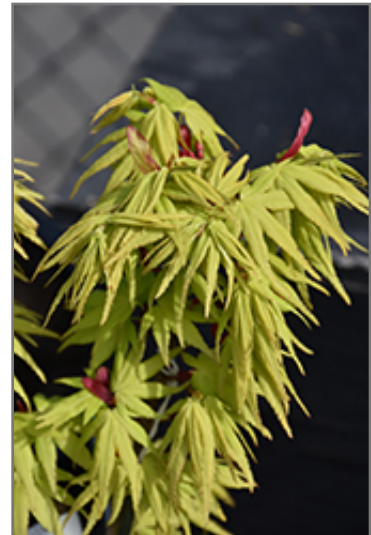
Mikawa Yatsubusa Japanese Maple foliage

Mikawa Yatsubusa Japanese Maple is recommended for the following landscape applications;