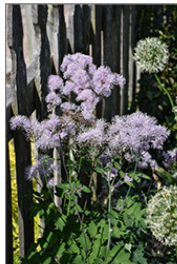
Meadow Rue flowers

Meadow Rue is recommended for the following landscape applications;