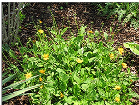
Sunshine Superman Tickseed in bloom