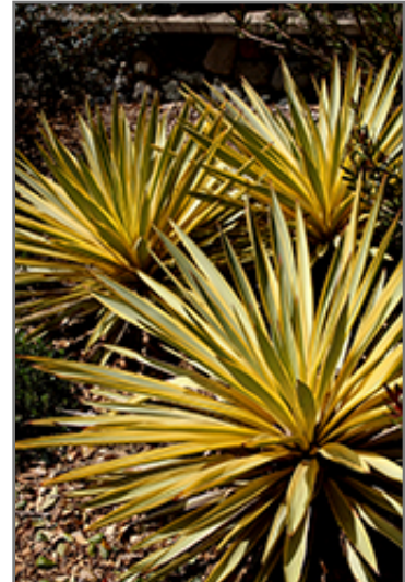
Bright Star Yucca