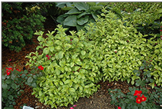
Ghost Weigela

This shrub should only be grown in full sunlight. It prefers to grow in average to moist conditions, and shouldn't be allowed to dry out. It is not particular as to soil type or pH. It is highly tolerant of urban pollution and will even thrive in inner city environments. This is a selected variety of a species not originally from North America.