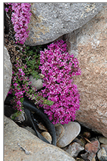
Pink Chintz Creeping Thyme in bloom