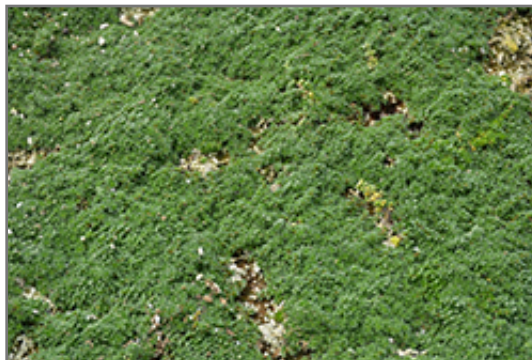
Elfin Creeping Thyme