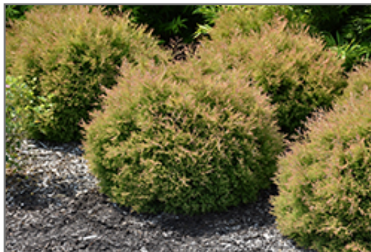
Fire Chief Arborvitae

Fire Chief Arborvitae will grow to be about 5 feet tall at maturity, with a spread of 5 feet. It tends to fill out right to the ground and therefore doesn't necessarily require facer plants in front, and is suitable for planting under power lines. It grows at a slow rate, and under ideal conditions can be expected to live for approximately 30 years.