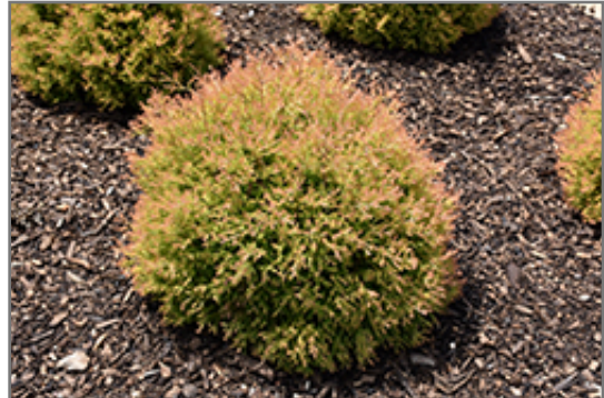
Fire Chief Arborvitae

Fire Chief Arborvitae is recommended for the following landscape applications;