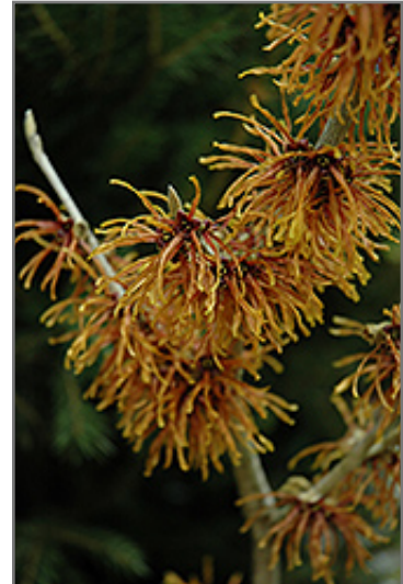
Jelena Witchhazel flowers