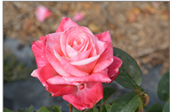
First Prize Rose flowers

This is a high maintenance shrub that will require regular care and upkeep, and is best pruned in late winter once the threat of extreme cold has passed. It is a good choice for attracting bees to your yard. Gardeners should be aware of the following characteristic(s) that may warrant special consideration;