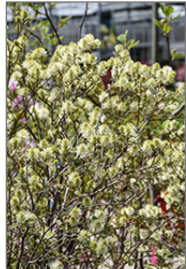
Mt. Airy Fothergilla flowers