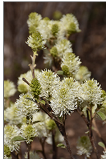
Mt. Airy Fothergilla flowers