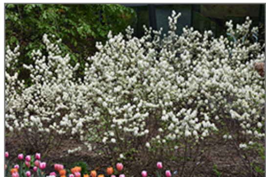
Mt. Airy Fothergilla in bloom