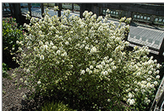
Mt. Airy Fothergilla in bloom