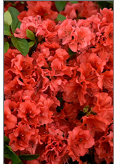
Girard's Hot Shot Azalea flowers