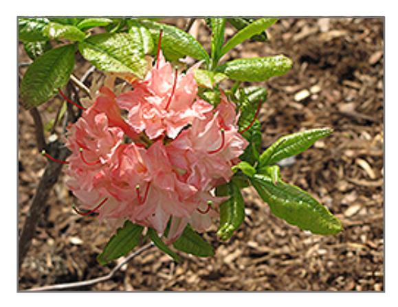
Cannon's Double Azalea flowers

Cannon's Double Azalea is recommended for the following landscape applications;