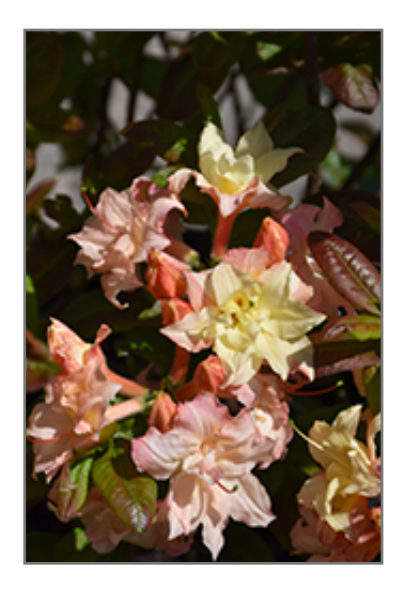
Cannon's Double Azalea flowers

This is a relatively low maintenance shrub, and should only be pruned after flowering to avoid removing any of the current season's flowers. It has no significant negative characteristics.