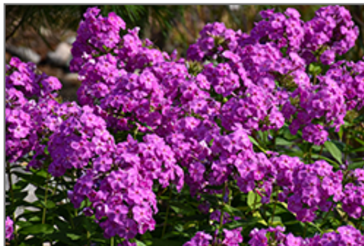
Flame Purple Garden Phlox flowers

Flame Purple Garden Phlox is a dense herbaceous perennial with an upright spreading habit of growth. Its medium texture blends into the garden, but can always be balanced by a couple of finer or coarser plants for an effective composition.