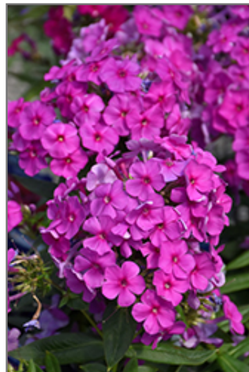
Flame Purple Garden Phlox flowers

Flame Purple Garden Phlox is a fine choice for the garden, but it is also a good selection for planting in outdoor pots and containers. It is often used as a 'filler' in the 'spiller-thriller-filler' container combination, providing a mass of flowers against which the larger thriller plants stand out. Note that when growing plants in outdoor containers and baskets, they may require more frequent waterings than they would in the yard or garden.