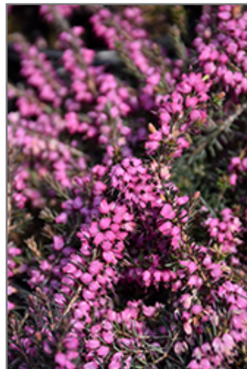
Springwood Pink Heath flowers

Springwood Pink Heath is recommended for the following landscape applications;