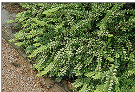
Edmee Gold Honeysuckle