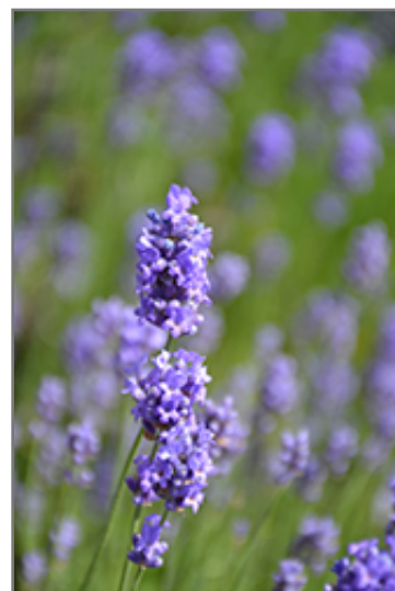
Hidcote Blue Lavender flowers