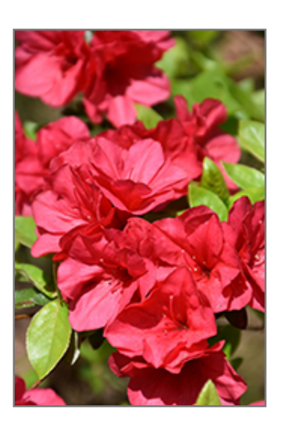
Christmas Cheer Azalea flowers