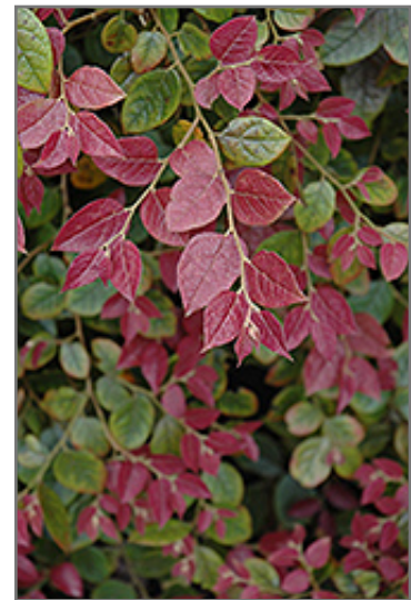
Razzleberri Fringeflower foliage