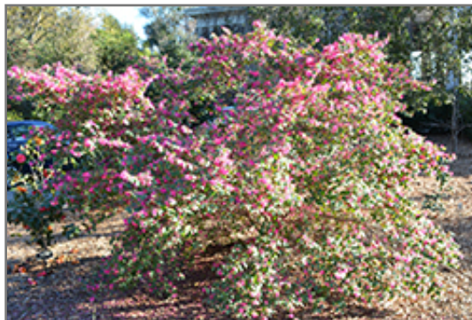
Razzleberri Fringeflower in bloom

This shrub does best in full sun to partial shade. It prefers to grow in average to moist conditions, and shouldn't be allowed to dry out. It is particular about its soil conditions, with a strong preference for rich, acidic soils. It is somewhat tolerant of urban pollution. Consider applying a thick mulch around the root zone in winter to protect it in exposed locations or colder microclimates. This is a selected variety of a species not originally from North America.