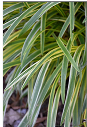
Silvery Sunproof Variegated Lily Turf foliage