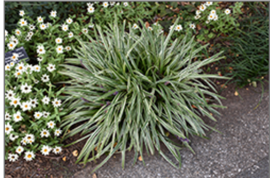
Silvery Sunproof Variegated Lily Turf in bloom

Silvery Sunproof Variegated Lily Turf is recommended for the following landscape applications;