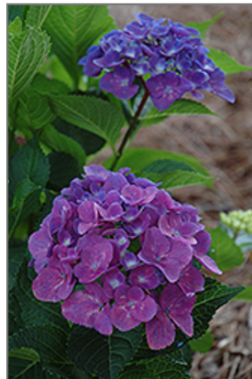
Cityline Venice Dwarf Hydrangea flowers

This shrub will require occasional maintenance and upkeep, and should only be pruned after flowering to avoid removing any of the current season's flowers. It has no significant negative characteristics.