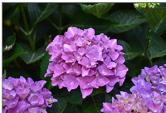
Cityline Venice Dwarf Hydrangea flowers

This shrub will require occasional maintenance and upkeep, and should only be pruned after flowering to avoid removing any of the current season's flowers. It has no significant negative characteristics.