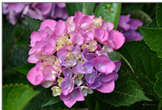
Cityline Venice Dwarf Hydrangea flowers