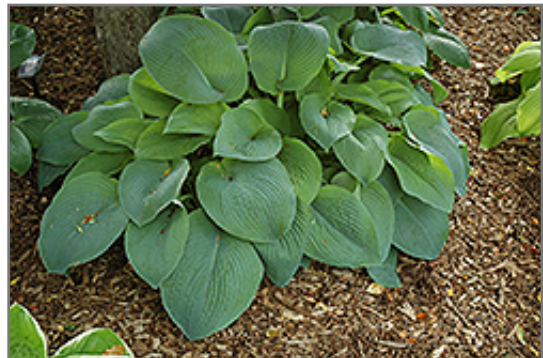
True Blue Hosta