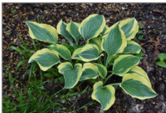
Liberty Hosta