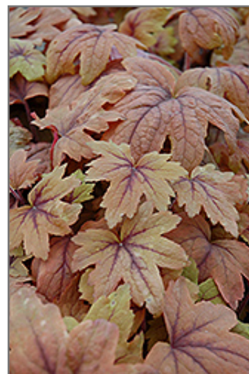
Sweet Tea Foamy Bells foliage