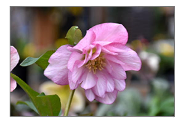
Cotton Candy Hellebore flowers

Cotton Candy Hellebore is recommended for the following landscape applications;