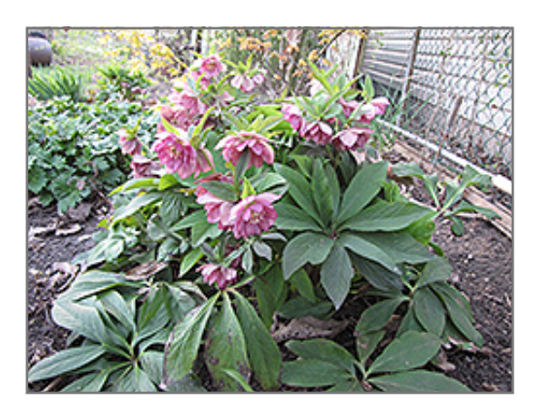
Berry Swirl Hellebore in bloom

Berry Swirl Hellebore is an herbaceous evergreen perennial with an upright spreading habit of growth. Its medium texture blends into the garden, but can always be balanced by a couple of finer or coarser plants for an effective composition.