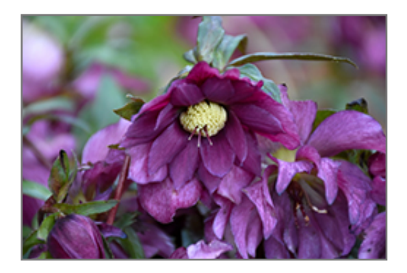
Berry Swirl Hellebore flowers