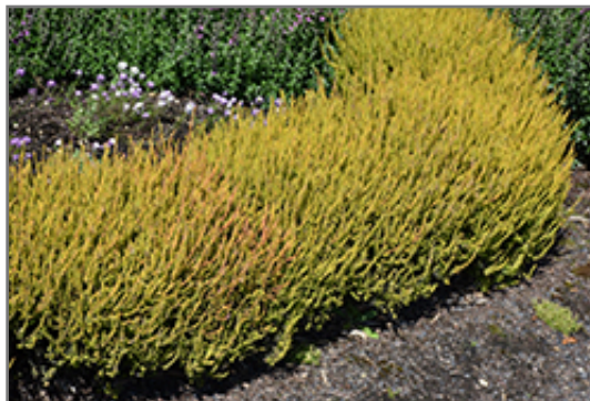
Firefly Heather

This shrub should only be grown in full sunlight. It requires an evenly moist well-drained soil for optimal growth, but will die in standing water. It is very fussy about its soil conditions and must have sandy, acidic soils to ensure success, and is subject to chlorosis (yellowing) of the foliage in alkaline soils. It is somewhat tolerant of urban pollution, and will benefit from being planted in a relatively sheltered location. Consider applying a thick mulch around the root zone in winter to protect it in exposed locations or colder microclimates. This is a selected variety of a species not originally from North America.