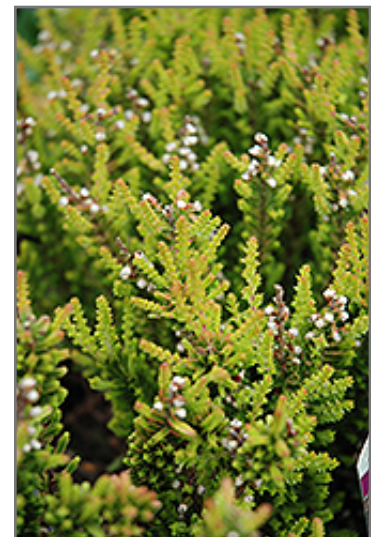
Firefly Heather foliage