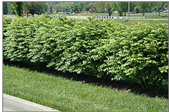
Cole's Compact Burning Bush