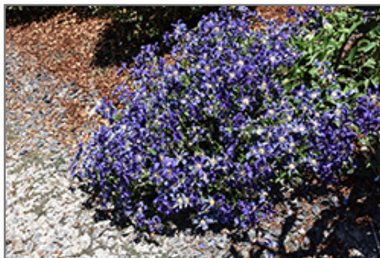
Sapphire Indigo Clematis in bloom