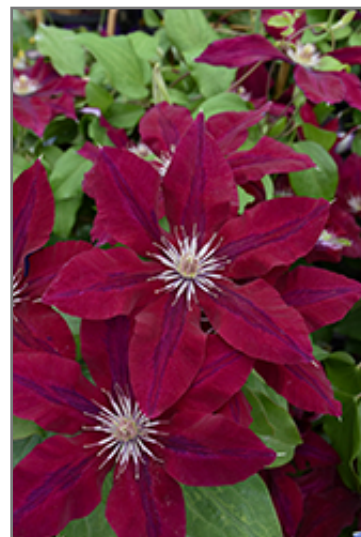
Rebecca Clematis flowers

Rebecca Clematis is recommended for the following landscape applications;