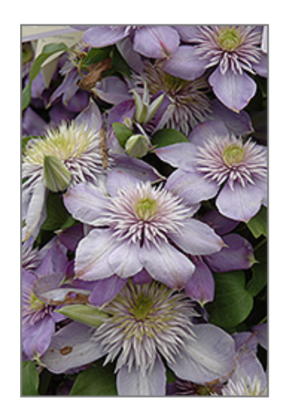
Blue Light Clematis flowers

Blue Light Clematis is a multi-stemmed deciduous woody vine with a twining and trailing habit of growth. Its average texture blends into the landscape, but can be balanced by one or two finer or coarser trees or shrubs for an effective composition.