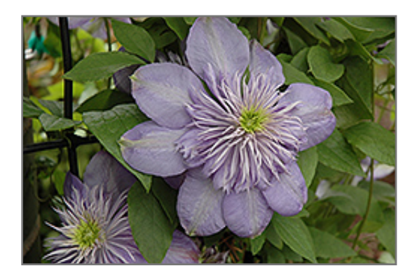
Blue Light Clematis flowers