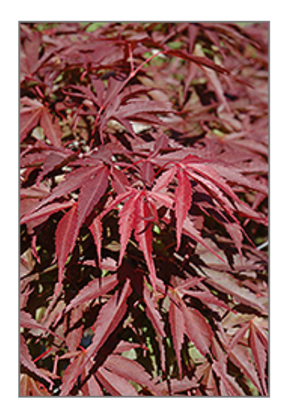
Red Dawn Full Moon Maple foliage

This is a relatively low maintenance tree, and should only be pruned in summer after the leaves have fully developed, as it may 'bleed' sap if pruned in late winter or early spring. It has no significant negative characteristics.