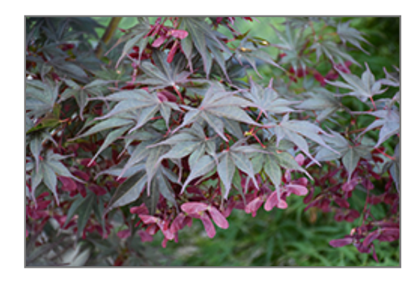
Red Dawn Full Moon Maple foliage

Red Dawn Full Moon Maple is recommended for the following landscape applications;