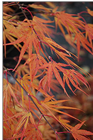
Scolopendrifolium Japanese Maple in fall

Scolopendrifolium Japanese Maple is a fine choice for the yard, but it is also a good selection for planting in outdoor pots and containers. Its large size and upright habit of growth lend it for use as a solitary accent, or in a composition surrounded by smaller plants around the base and those that spill over the edges. It is even sizeable enough that it can be grown alone in a suitable container. Note that when grown in a container, it may not perform exactly as indicated on the tag - this is to be expected. Also note that when growing plants in outdoor containers and baskets, they may require more frequent waterings than they would in the yard or garden.