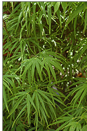
Scolopendrifolium Japanese Maple foliage

Scolopendrifolium Japanese Maple is recommended for the following landscape applications;