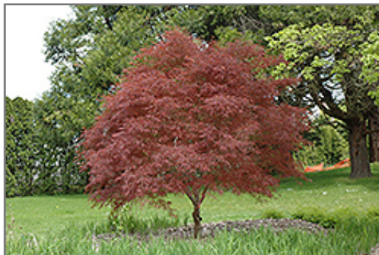
Dwarf Red Pygmy Japanese Maple

Dwarf Red Pygmy Japanese Maple is recommended for the following landscape applications;