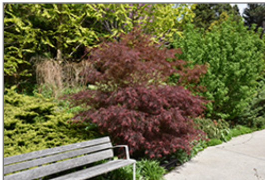
Dwarf Red Pygmy Japanese Maple

Dwarf Red Pygmy Japanese Maple is a fine choice for the yard, but it is also a good selection for planting in outdoor pots and containers. Because of its height, it is often used as a 'thriller' in the 'spiller-thriller-filler' container combination; plant it near the center of the pot, surrounded by smaller plants and those that spill over the edges. It is even sizeable enough that it can be grown alone in a suitable container. Note that when grown in a container, it may not perform exactly as indicated on the tag - this is to be expected. Also note that when growing plants in outdoor containers and baskets, they may require more frequent waterings than they would in the yard or garden.