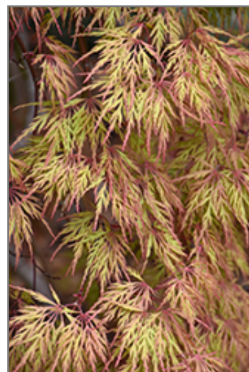
Orangeola Cutleaf Japanese Maple foliage