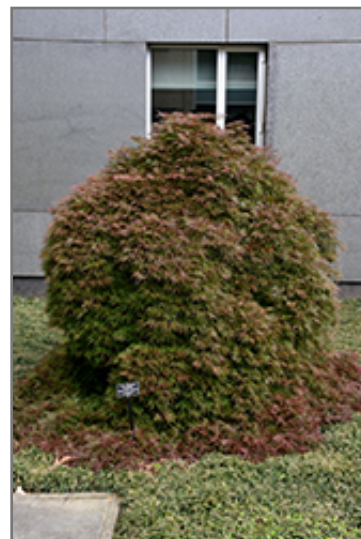
Orangeola Cutleaf Japanese Maple

This is a relatively low maintenance tree, and should only be pruned in summer after the leaves have fully developed, as it may 'bleed' sap if pruned in late winter or early spring. It has no significant negative characteristics.